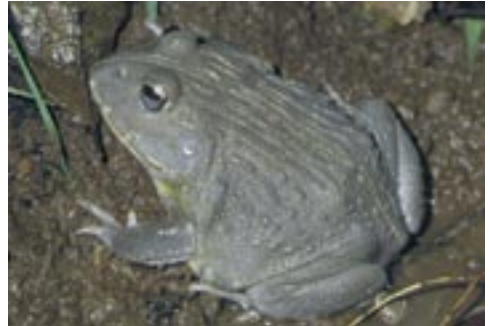
Fig. 6. Breeding Pyxicephalus edulis males from Malindi, Kenya (top) and northern Pendjari National Park, Benin (bottom) to illustrate differences between East and West African specimens.

to mandible). However, according to POYNTON (1970) this character varies and hence is useless. POYNTON (1970) mentions that the mid dorsal pair of skin folds in P. floweri is continuous from the occiput to the vent. POYNTON & BROADLEY (1985) recognize P. floweri and P. cotti . The later is said to have very interrupted skin folds. According to the original description of P. floweri , based on a single male (SVL 45 mm), this species has only feebly prominent and interrupted dorsal, glandular folds, but a strong and continuous dorsolateral fold (BOULENGER 1917). POYNTON & BROADLEY (1985) give the tibia length of P. cotti as ranging from 51-57 % of the body length ( P. floweri : 44 %). PERRET (1966) distinguishes two species from Cameroon, P. floweri and P. cotti , amongst other characters