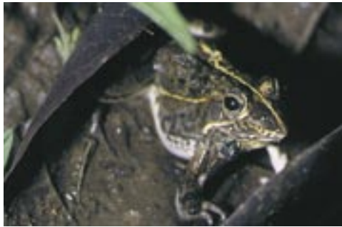
Fig. 8. Ptychadena trinodis male in calling position at the bank of a savannah pond.