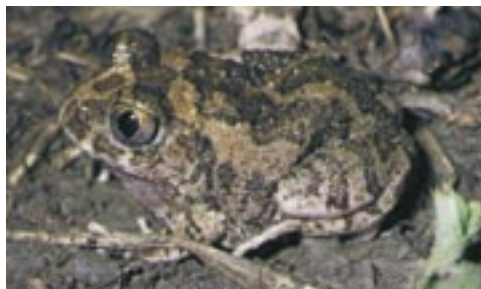
Fig. 11. Leptopelis bufonides male from Pendjari National Park.