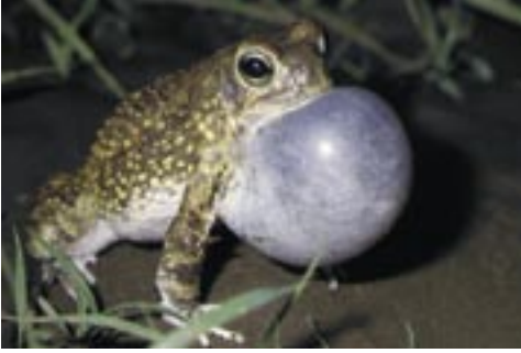
Fig. 4. Calling Bufo pentoni male at a road puddle close to the village of Batia, illustrating the short snout and enormous size of the vocal sac.