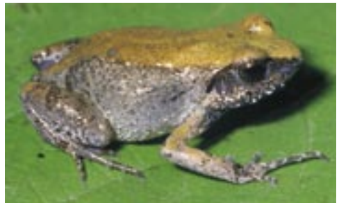
Fig. 10. Three male Arthroleptis sp. from the Tanougou waterfall population, illustrating variability of colour patterns.

because of differing tibia length. Later he discusses P. schillukorum (male SVL: 39-51 mm) with P. floweri (male SVL: 38-51 mm) and P. cotti (the later treating as a synonym