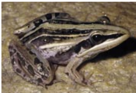
Fig. 9. Ptychadena tournieri male from southern Pendjari National Park.