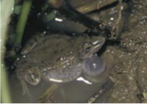
Fig. 7. Calling Ptychadena cf. schillukorum male at the bank of a savannah pond (see Fig. 2).