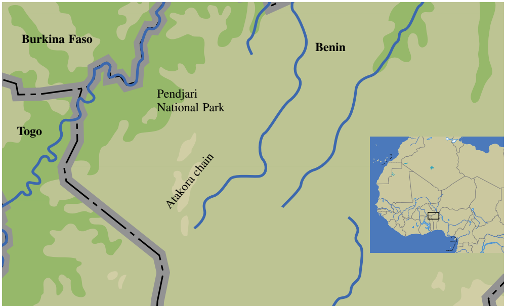
Fig. 1. Map of the Pendjari region (black square in insert photo). The Atakora chain forms the southern border of the reserve. The Pendjari River constitutes its north-western border. Country boundaries are marked in grey.

puddle. At a given site only a few males were calling (Fig. 4), whereas others males were sitting aside remaining mute. Unfortunately we have no data which males eventually succeeded with reproduction. Chorus size was usually less than 20 males. We could confirm the extremely fast development of B. pentoni tadpoles, leaving their waters only 10-13 days after spawning took place (FORGE & BARBAULT 1977).