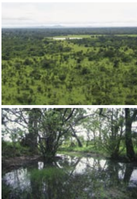
Fig. 2. Overview of typical savannah habitats in the Pendjari buffer zone with a permanent waterhole in the background (top). Temporary savannah pond (bottom), breeding site of e.g. Ptychadena cf. schillukorum , Phrynobatrachus francisci , P. natalensis , Leptopelis viridis and Kassina fusca .

LAMBIRIS (1989) characterizes P. edulis (as P. adspersus edulis ) as being smaller than 120 mm SVL, having a tympanum with a distinct white spot, a strongly barred upper lip in adults and a frequently present light interocular bar. According to CHANNING et al.